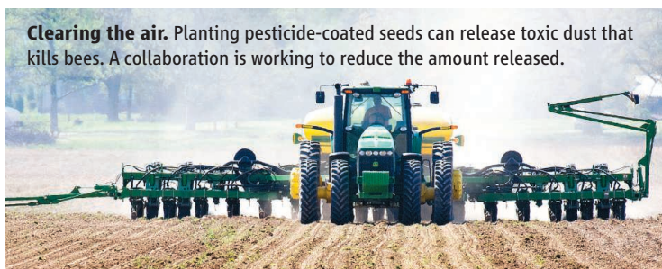
Clearing the air. Planting pesticide-coated seeds can release toxic dust that kills bees. A collaboration is working to reduce the amount released.

The event brightened the spotlight on the potential dangers of a family of pesticides called neonicotinoids. In 1999, France had banned one neonicotinoid, barring the use of imidacloprid on sunflower seeds after beekeepers suspected that it had killed a third of their colonies. Now, citing evidence from laboratory and field studies that neonicotinoids threaten honey bees and other pollinators, the European Union is poised to ban the use of three of the most common neonicotinoids in several crops by the end of the year.