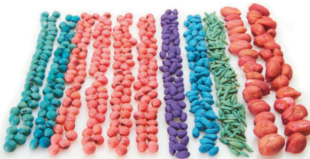
Diverse. Neonicotinoid-treated seeds are used in many crops, including soybeans, cotton, rice, and peanuts. Color serves as a warning.