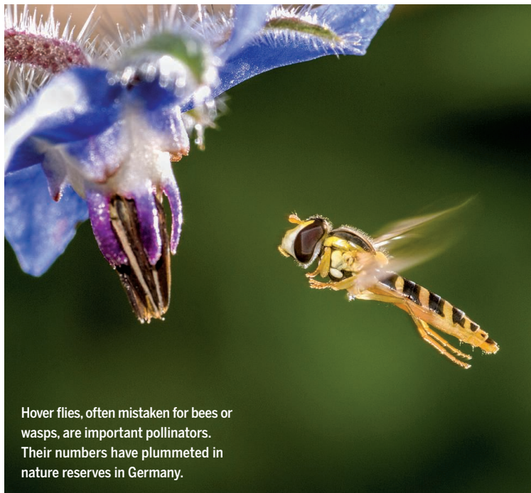
Hover flies, often mistaken for bees or wasps, are important pollinators. Their numbers have plummeted in nature reserves in Germany.

Changes in land use surrounding the reserves are probably playing a role. “We’ve lost huge amounts of habitat, which has certainly contributed to all these declines,” Goulson says. “If we turn all the seminatural habitats to wheat and cornfields, then there will be virtually no life in those fields.” As fields expand and hedgerows disappear, the isolated islands of habitat left can support fewer species. Increased fertilizer on remaining grazing lands favors grasses over the diverse wildflowers that many insects prefer. And when development replaces the countryside, streets and buildings generate