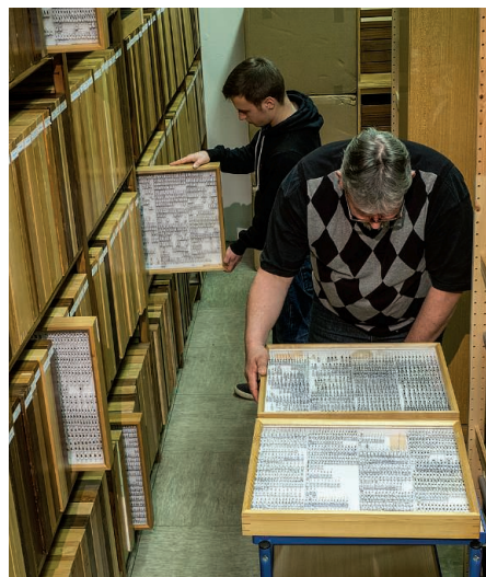
The Krefeld Entomological Society’s collections contain millions of insect specimens.

The layers revealed a striking change in the birds’ diets in the 1940s, around the time DDT was introduced. The proportion of beetle remains dropped off, suggesting the birds were eating smaller insects—and getting fewer calories per catch. The proportion of beetle parts increased slightly again